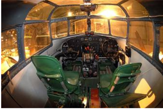
Douglas B-18 cockpit at the National Museum of the United States Air Force.