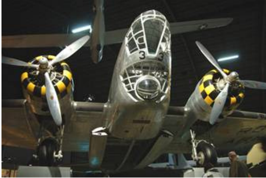
Douglas B-18 Bolo in the World War II Gallery at the National Museum of the United States Air Force.