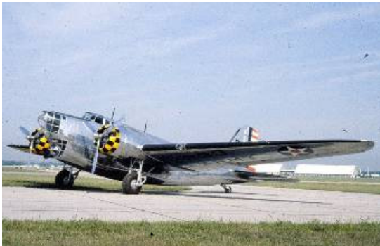
DAYTON, Ohio -- Douglas B-18 Bolo at the National Museum of the United States Air Force.

The Douglas Aircraft Co. developed the B-18 to replace the Martin B-10 as the U.S. Army Air Corps' standard bomber. Based on the Douglas DC-2 commercial transport, the prototype B-18 competed with the Martin 146 (an improved B-10) and the four-engine Boeing 299, forerunner of the B-17, at the Air Corps bombing trials at Wright Field in 1935. Although many Air Corps officers judged the Boeing design superior, the Army General Staff preferred the less costly Bolo (along with 13 operational test YB-17s). The Air Corps later ordered 217 more as B-18As with the bombardier's position extended forward over the nose gunner's station.