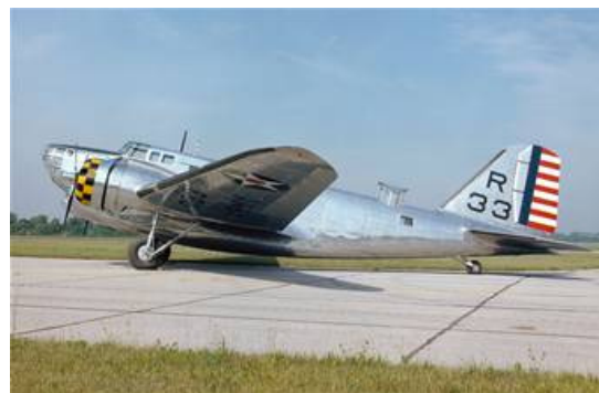
Douglas B-18 Bolo at the National Museum of the United States Air Force.